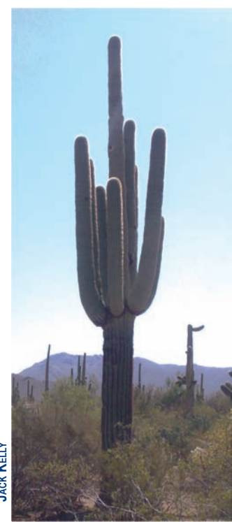
A mature "Saguaro' cactus (Carnegiea gigantea)

Prune off any damaged roots with sharp, clean pruners. Then, prune back the remaining lateral root stubs, leaving them five to ten inches long. Dust these cuts and other wounds immediately with powdered sulphur to lessen chance of infection and hasten callousing (healing).