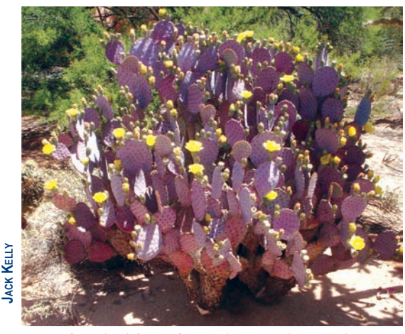
Opuntia violacea 'Santa Rita', an Arizona native 'prickly pear' cactus

Transplanting is usually necessary since cacti seldom occur naturally in desired landscape locations. Although they can be transplanted year-round in southern Arizona's lower elevations, quicker reestablishment can be expected from March through October. Warmer temperatures favor active root growth and, consequently, quicker establishment of the transplant.