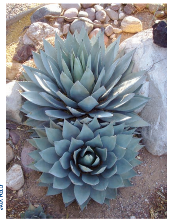
Agave parryi, a popular garden agave species

variety in size, color and form are available within this interesting family of desert tolerant succulents. Many varieties of agave die soon after flowering, however, some varieties will produce offsets around the base of the original plant which will develop and replace the original plant. Some varieties such as Octopus agave ( Agave vilmoriniana ) produce small plants (bulbils) on the flower stalk; that can be removed and easily rooted.