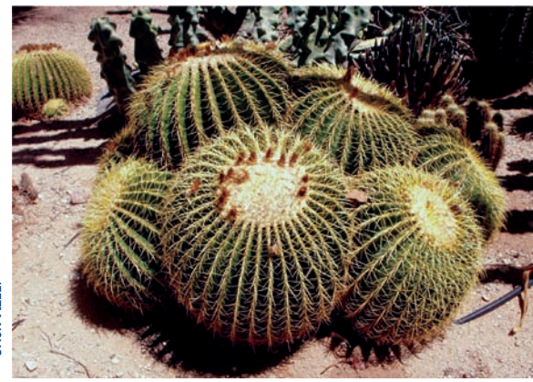
Golden barrel cactus (Echinocactus grusonii)

The thick waxy coated stems of these perennial herb are quite resistant to moisture evaporation, which gives them considerable drought tolerance. Desert cacti are leafless; however, most have spines. Photosynthesis (food production for the plant) occurs within the green outer cortex of the stems, and moisture reserves are stored in the internal part of the stems, sustaining these plants through prolonged dry periods of desert climates. Structural support for cactus plants is provided by internal fibrous or woody skeletal forms. Most cacti have tapering tap roots that anchor the plant and fleshy lateral roots close to the soil surface that extend outward for several feet in all directions. These absorb and store moisture and nutrients. The roselike flowers of cacti, which are contrastingly delicate and beautifully colored, produce edible although sometimes not too palatable fruit.