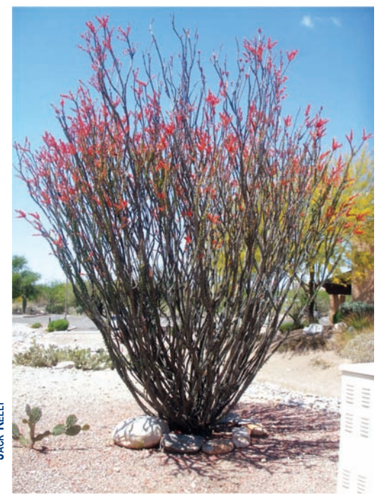
'Ocotillo' Fourquieria splendens in full bloom

Fertilization with a well-balanced plant food in light to moderate amounts will usually help stimulate plant growth and vigor. However, do not apply fertilizer to newly transplanted plants. When using fertilizers, apply them evenly to the soil surface over the rooting area and water it into the soil with an early summer irrigation. Don't risk over-fertilizing. As with irrigation - if in doubt, don't.